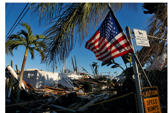
Catastrophic events can wreak havoc for individuals. MOAA's Crisis Relief Program offers financial assistance